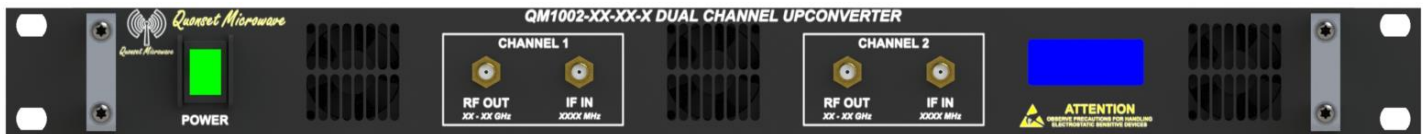
Figure 2. Front panel connections to QM1002-2-18.

The necessary front and back panel input/output connections on a QM1002 Series frequency converter are summarized in Table 1. The front-panel connections are shown in Figure 2 while the rear-panel connections are shown in Figure 3. Interface connections for the optional Outdoor Unit are similar.