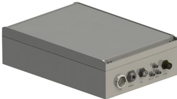
QM1002-2-18 in Optional Outdoor Unit Form-Factor