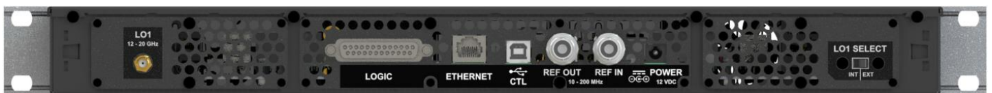
Figure 3. Rear-panel connections to QM1003-2-18.