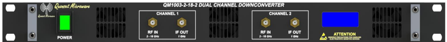
Figure 2. Front panel connections to QM1003-2-18.

The necessary front and back panel input/output connections on a QM1003 Series frequency converter are summarized in Table 1. The front-panel connections are shown in Figure 2 while the rear-panel connections are shown in Figure 3. Interface connections for the optional Outdoor Unit are similar.