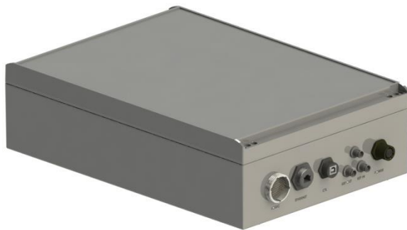
QM1004-26-40 in Optional Outdoor Unit Form-Factor