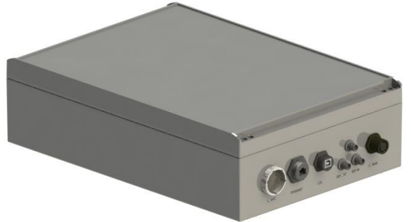
QM1002-1-2 in Optional Outdoor Unit Form-Factor