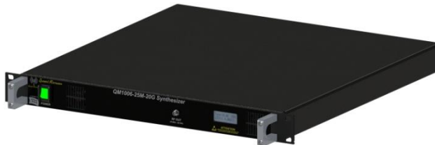
QM1006-25M-20G 1U 19" Rack-Mount