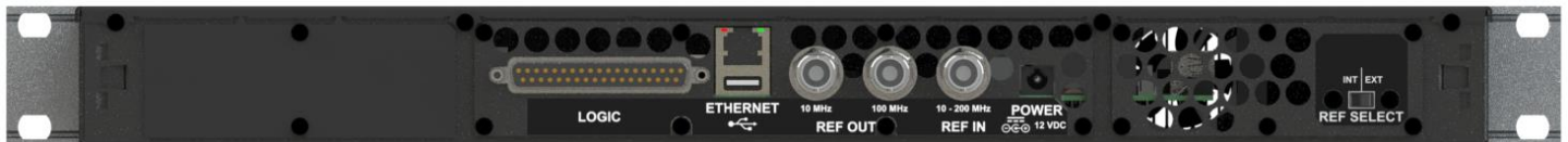
Figure 3. Rear-panel connections to QM1006-25M-20G.