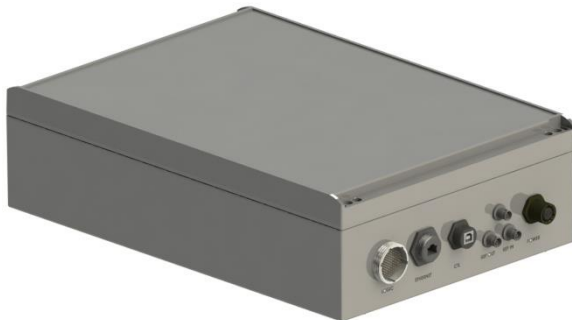
QM1002-1-2 in Optional Outdoor Unit Form-Factor