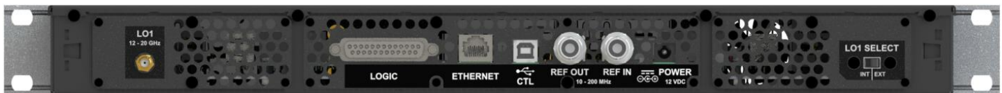
Figure 3. Rear-panel connections to QM1002-1-2.