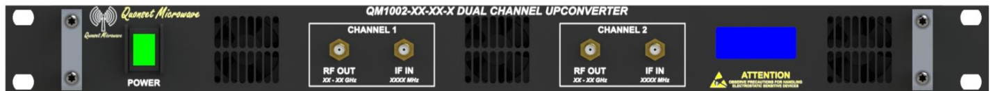
Figure 2. Front panel connections to QM1002-1-2.

The necessary front and back panel input/output connections on a QM1002 Series frequency converter are summarized in Table 1. The front-panel connections are shown in Figure 2 while the rear-panel connections are shown in Figure 3. Interface connections for the optional Outdoor Unit are similar.