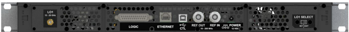
Figure 3. Rear-panel connections to QM1003-0.5-18.