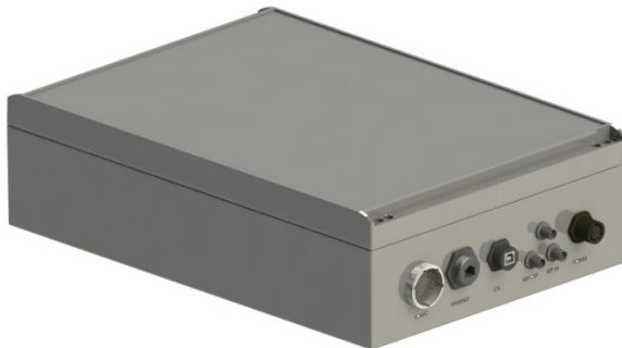
QM1003-0.5-18 in Optional Outdoor Unit Form-Factor